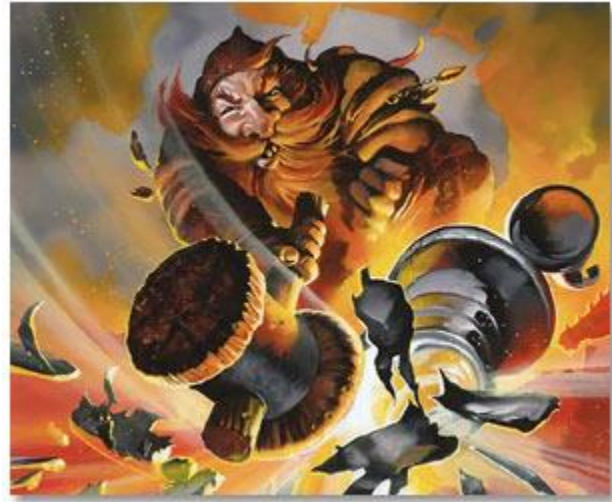
Demolish, art by Gary Ruddell

Red is the colour of chaos and blowing stuff up. Chaos, in Magic: the Gathering terms, is fairly rubbish, as anyone who has opened up a booster pack only to discover that they have a card with about eighteen lines of text which mentions flipping a coin as the rare will know. Blowing stuff up, though, is an extremely enjoyable way to spend the time. Lands, creatures, artifacts, opponents, especially the last of these, are all fair game for the Red mage. This is a much healthier attitude than that of any of the other colours. It's not like the Blue mage, who stops the opponent from playing their cards (no fun). When playing Red, you let your opponent go about his business, and then you smash up anything which appears to be relevant and ignore the rest.